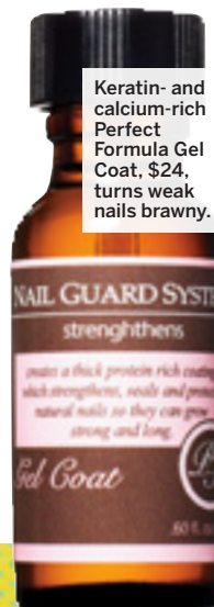
Keratin- and calcium-rich Perfect Formula Gel Coat, $24, turns weak nails brawny.

You know that keeping water handy pre- and post-workout is crucial to reach your peak performance—but it's just as crucial for keeping nails, well, tough as nails. "When nails are hydrated, they have more flexibility," Dr. Gross says. Moisturize from the outside in by applying a cuticle oil with jojoba oil and vitamin E, a combo that penetrates deeper than classic cream, Nam says.