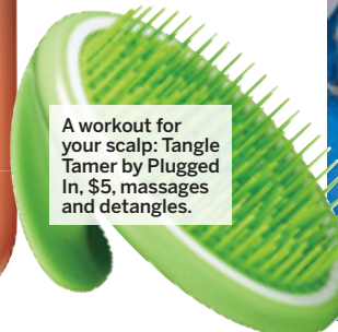
A workout for your scalp: Tangle Tamer by Plugged In, $5, massages and detangles.