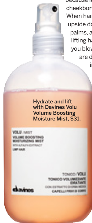
Hydrate and lift with Davines Volu Volume Boosting Moisture Mist, $31.

because it creates the illusion of high cheekbones and eyes that are awake." When hair is damp, flip your head upside down, spray a texturizer on palms, and rake fingers through roots, lifting hair away from your scalp as you blow-dry. When only your roots are dry, flip upright and you'll see instant volume. Then, as you dry the rest of your hair, stretch out strands with a nylon-bristle brush—follow through from root to tip, flicking ends upward to add subtle curve. (Yes, your biceps will be burning by the time you're done.)